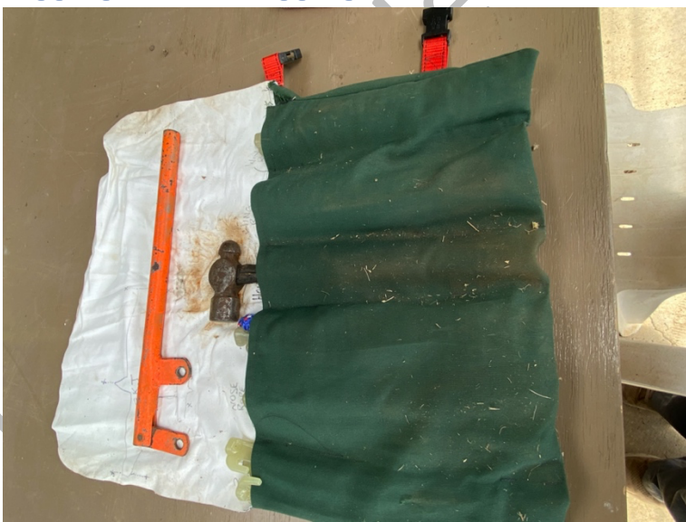
Figure 8 Rigging Tool and tie down kit