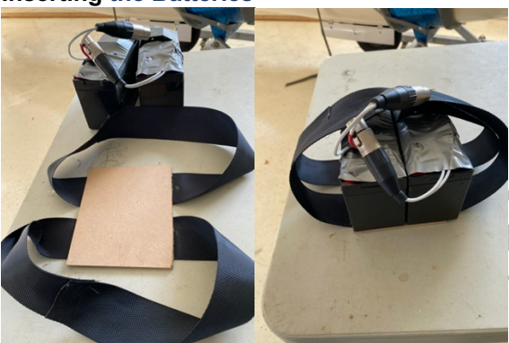
Figure 1- battery straps