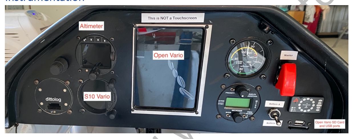
Figure 4- Instrument panel