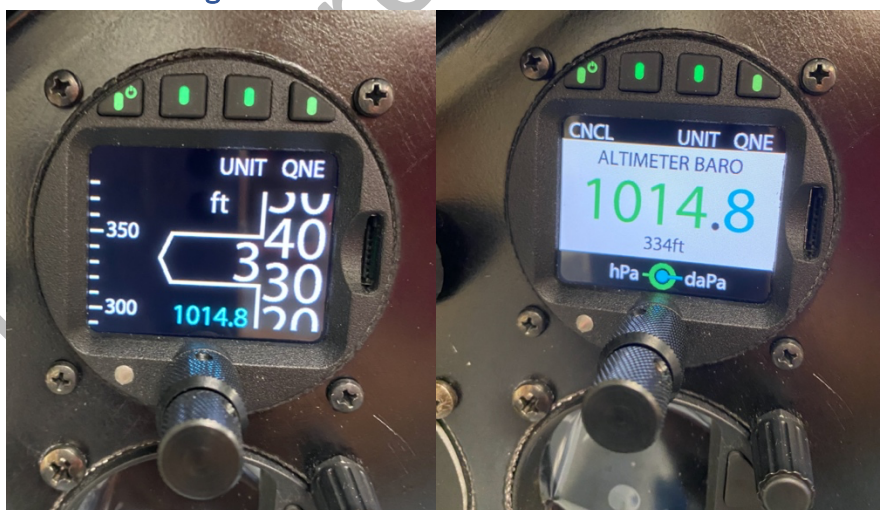
Figure 6 - altimeter main screen