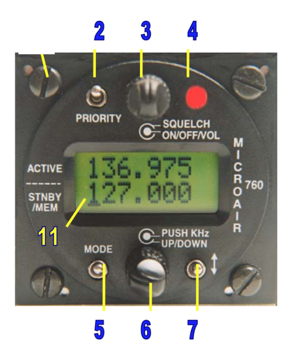
Figure 5 - Radio functions