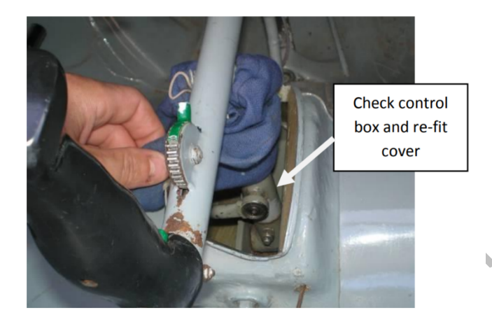
Figure 3 inspection of brakes and control box